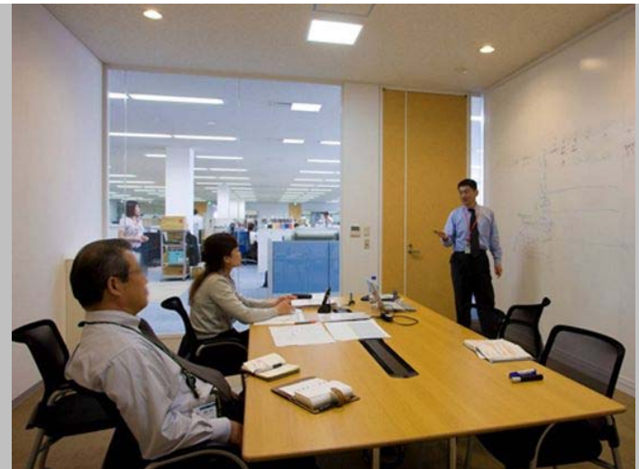
Thanks to the "white-board wall-space", this meeting room creates an effective space for collaboration.