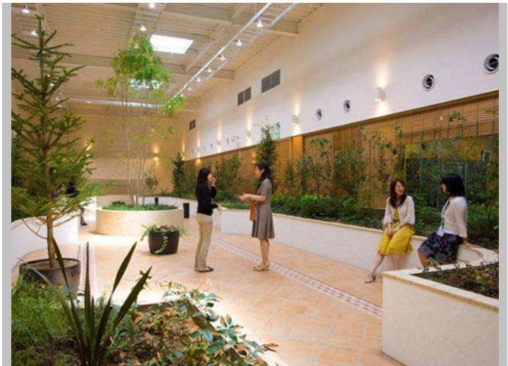
Optical Garden. Encourages communication in a vibrant green environment.