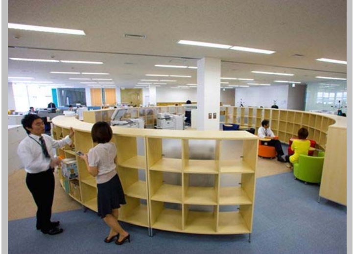
Colourful break-out area, designed to facilitate easy communication.