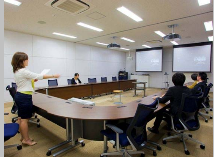
Presentation room which uses AV/TV to make paperless meetings a reality.