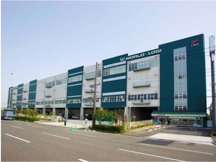
The outside of the building