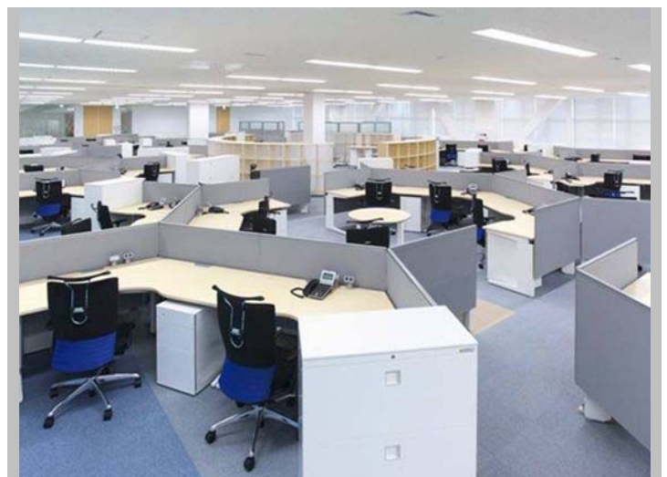
Open-plan office, a layout which is expected to improve the synergy of the office as a whole.