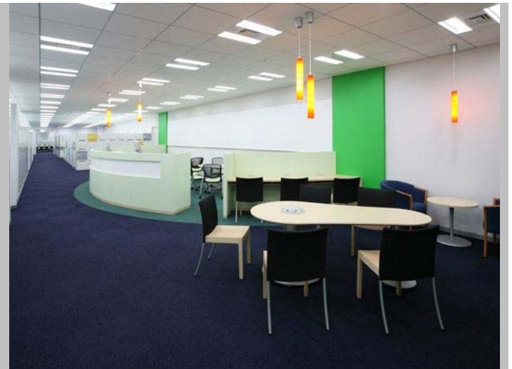
Break-out area, combining a meeting area with a library and copy / fax machines.