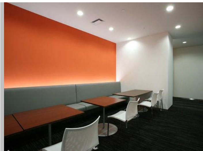
Café-style reception area with striking décor.

In 1983 the Computer department of the famous Japanese engineering company JGC Corporation broke away to become JGC Information Systems Company Ltd. In conjunction with their 25 th anniversary in 2008, they decided to take a leap forward and expand operations so they moved offices to the Minatomirai area. Using the concept "An office for winners", Okamura aimed to create an office that would heighten performance and increase the corporate value. The "More than just an Office" concept was developed with this in mind. We introduced a hot-desking system and to back this up, space for meetings and discussions was created, along with break-out areas to offer the option of relaxation. At the same time the opportunity was taken to increase security and reform business practises. 6 pieces of graphic art were placed in the office to symbolise the path that the business should take and create a positive attitude towards the future. In addition, the visitors area enables people to enjoy the ocean view. Even after the move JGC have continued to work with the project team to maintain and improve the office environment.