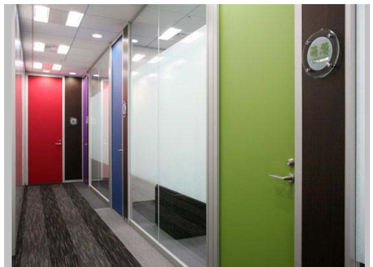
The corridor outside the executive meeting rooms, all of which are decorated using traditional Japanese colours such as red, indigo and grass-green. They are named according to these colours.