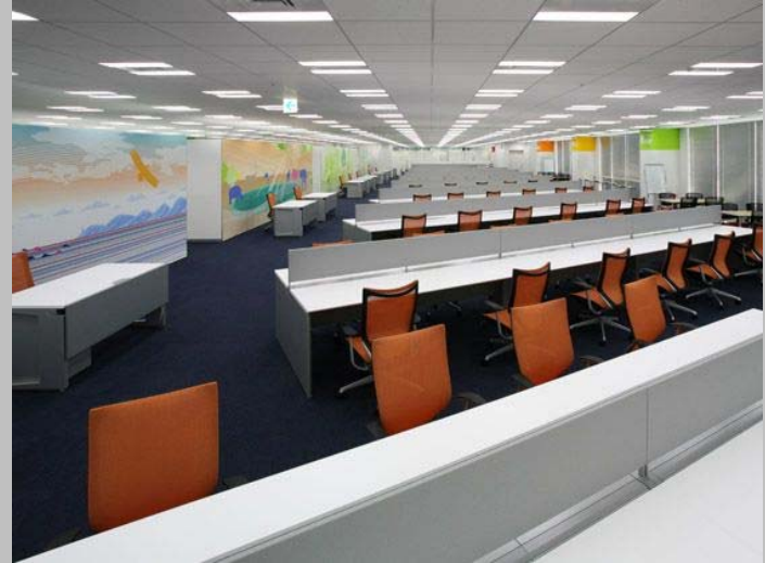
Incorporation of graphic art helps to express the path the business should take.