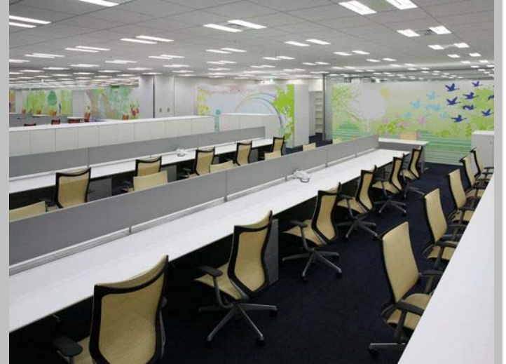
The theme of the art is: "Start of journey→Growth→Prosperity→Hope→Success."