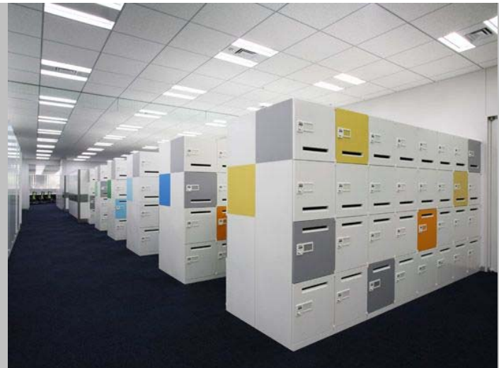
The location markers of the mobile lockers are colourful and vibrant, designed to appeal to the eye.